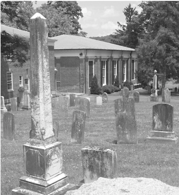
View of the New Providence cemetery.

At 5:30, members and guests are invited to join in a dessert social in the rear of New Providence's fellowship hall prior to the 6:00 lecture. Members are asked to bring a favorite dessert which can be shared with other attendees. Coffee and iced tea will be provided. The lecture is open to the public.