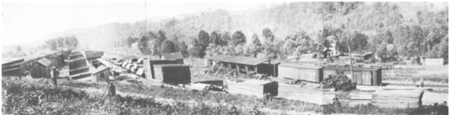
Above photographs of workmen and and the lumber company site were provided by Washington and Lee University's Special Collections.